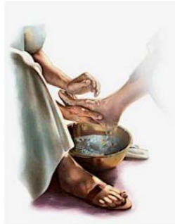
John (13: 4-18)